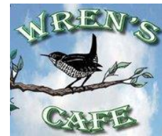
Merchant Street, Vacaville