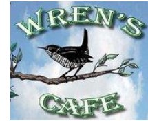
Merchant Street, Vacaville