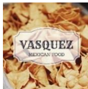
E. Main Street, Vacaville