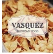
E. Main Street, Vacaville