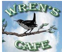
Merchant Street, Vacaville