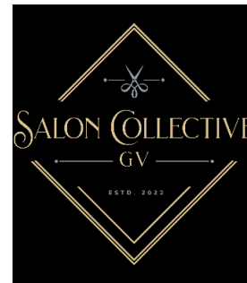
Salon Collective GV 4171 E Suisun Valley Road Fairfield, CA