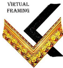
Solano Town Center, Fairfield