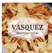
E. Main Street, Vacaville