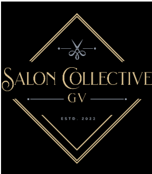
Salon Collective GV 4171 Suisun Valley Road, #E, Fairfield